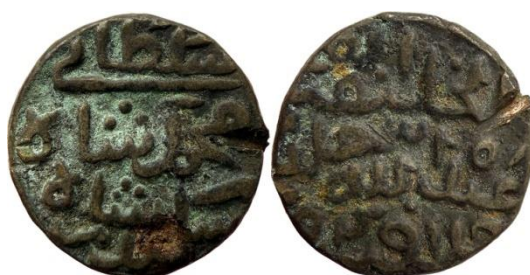
Sikandar Shah I