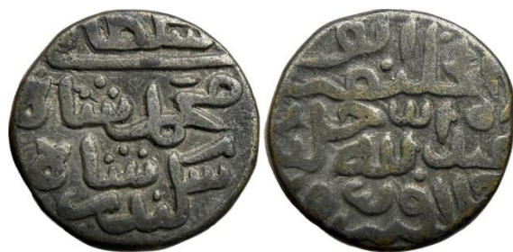
Sikandar Shah I