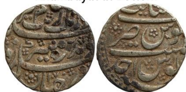
Khambayat at Top