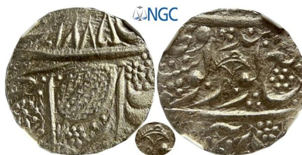
VS 1885/1900 INDIA RUPEE SIKH EMPIRE - AMRITSAR UNC DETAILS ENVIRONMENTAL DAMAGE