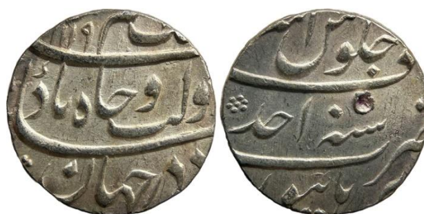
Azam Shah Burhanpur