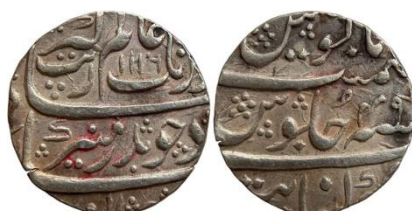
Khambayat at Bottom

545. Mughal, Aurangzeb (AH 1068-1118, 1658-1707 AD), Silver Rupee , 11.62 gms, 24.78 mm, Junagarh / Junagadh Mint (bottom on rev), AH 1101, RY 33, KM # 300.43 , extremely fine, very scarce. 545. Estimated Price - ₹1,500 – 1,800