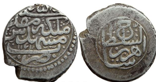
23.04 Grams Double (2) Rupī