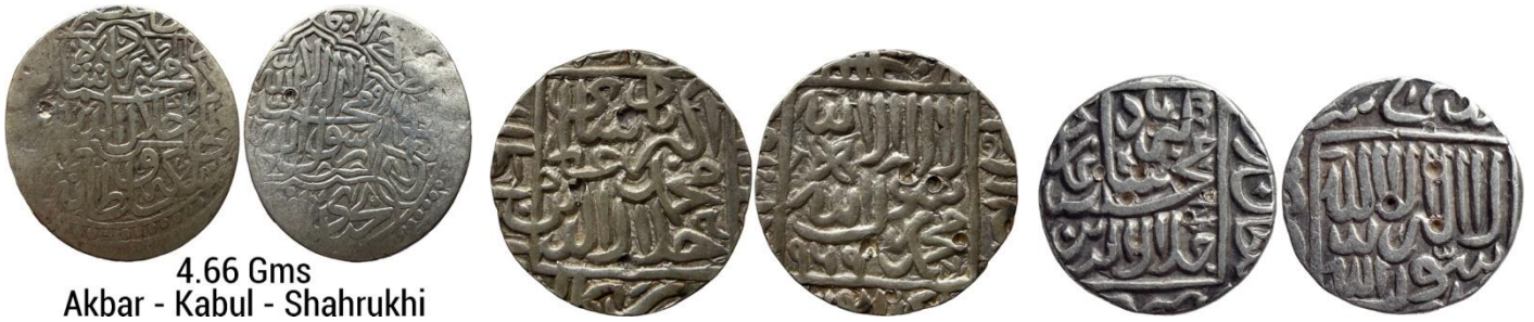
4.66 Gms Akbar - Kabul - Shahrukhi