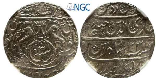
AH1237//3 INDIA RUPEE AWADH AU DETAILS CLEANED