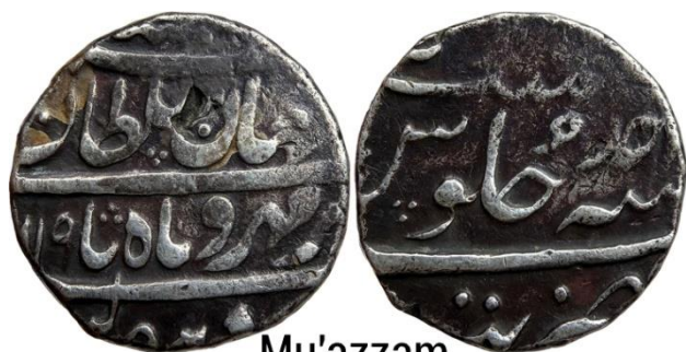
Mu'azzam 566. (2x)