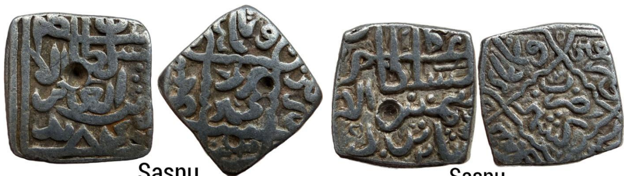
Sasnu Zain ul-Abidin