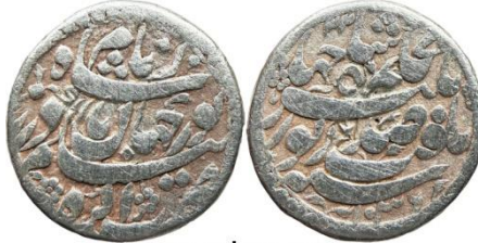
Nur Jahan Agra