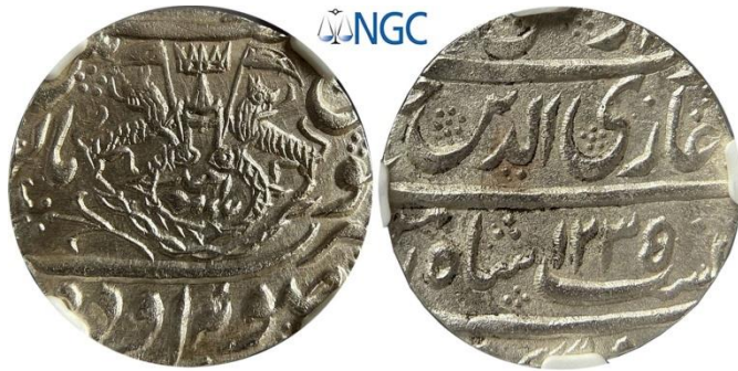
AH1235//1 INDIA RUPEE AWADH GHAZI UD-DIN HAIDAR UNC DETAILS ENVIRONMENTAL DAMAGE