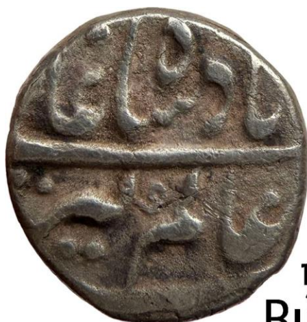
1/4 Rupee Nisar

533. Mughal, Murad Bakhsh (AH 1068, 1658 AD), Silver 1/2 Rupee , 4.78 gms, 18.38 mm, Surat Mint (mostly visible in left quadrant on obv), AH (1068), RY (Ahd), KM # 270.2 , very fine, very rare. 533. Estimated Price - ₹12,000 – 14,000