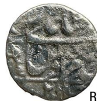
1/2 Rupee Murad Bakhsh Surat