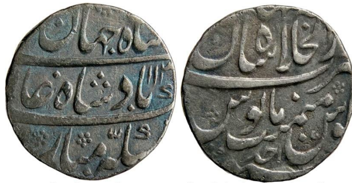
Shah Jahan II Shahjahanabad