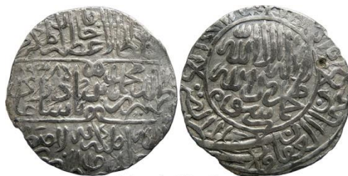
Zahir al-Din Babar