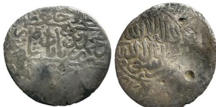
Zahir al-Din Babar