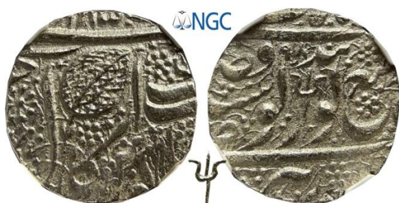
VS 1885/98 INDIA RUPEE SIKH EMPIRE - AMRITSAR UNC DETAILS ENVIRONMENTAL DAMAGE