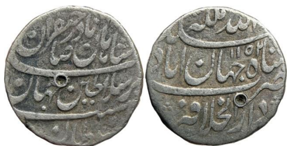
Nadir Shah Shahjahanabad