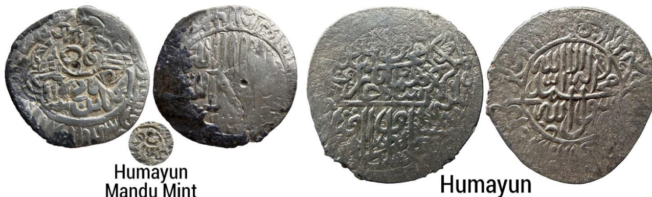
Humayun Mandu Mint

423. Mughal, Humayun (AH 937-947, 1530-1556 AD), Silver Shahrukhi, 4.71 gms, 27.43 mm, Lahore Mint, AH 946, Zeno # 49903, Album # B2462?, ex mount overall very fine, very rare. 423. Estimated Price - ₹8,000 – 10,000