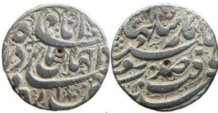
Nur Jahan Agra