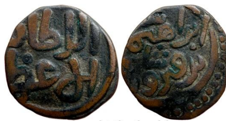
Rukn al-Din Ibrahim