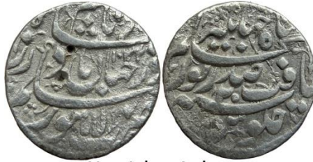
Nur Jahan Lahore