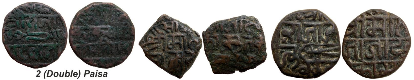
2 (Double) Paisa