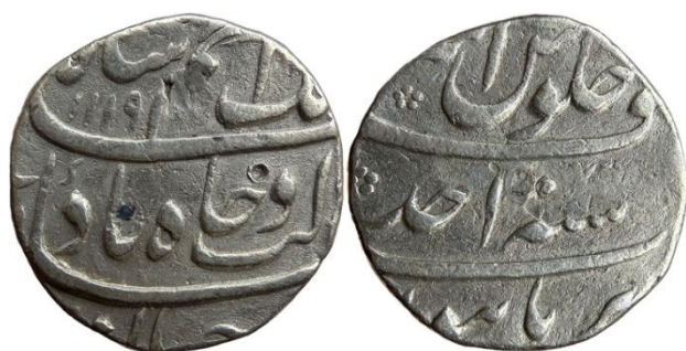
Azam Shah Burhanpur