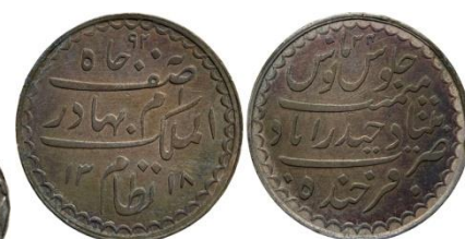
Hyderabad Charkhi Rupee