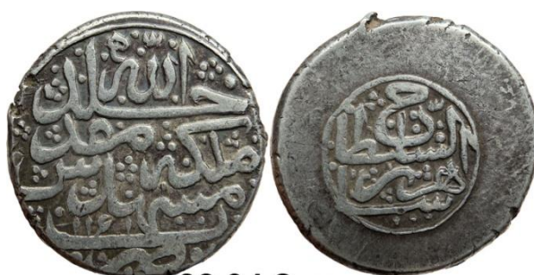
23.04 Grams Double (2) Rupī