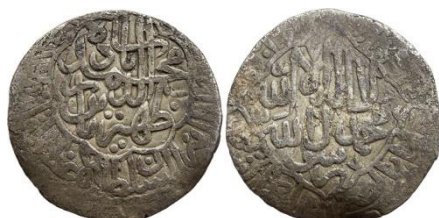
Zahir al-Din Babar