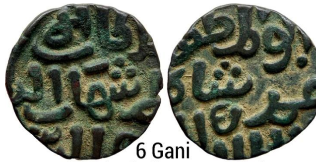
6 Gani Shihab al-din Umar Shah