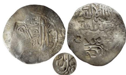
Zahir al-Din Babar