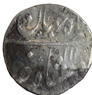
Shah Jahan II - Murshidabad