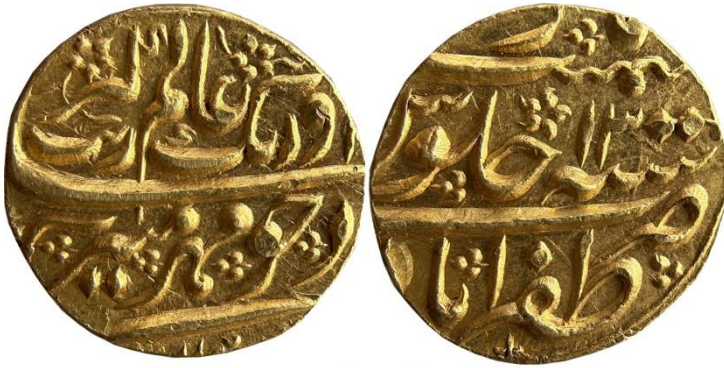
Aurangzeb - Zafrabad