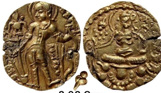
8.98 Gms Skandagupta