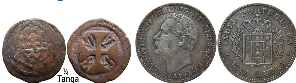
1/4 Tanga 469. (1.5x)