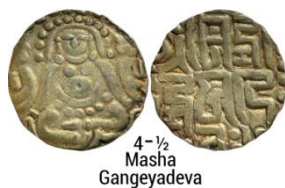
4- \frac{1}{2} Masha Gangeyadeva