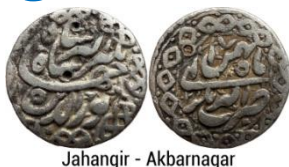
Jahangir - Akbarnagar