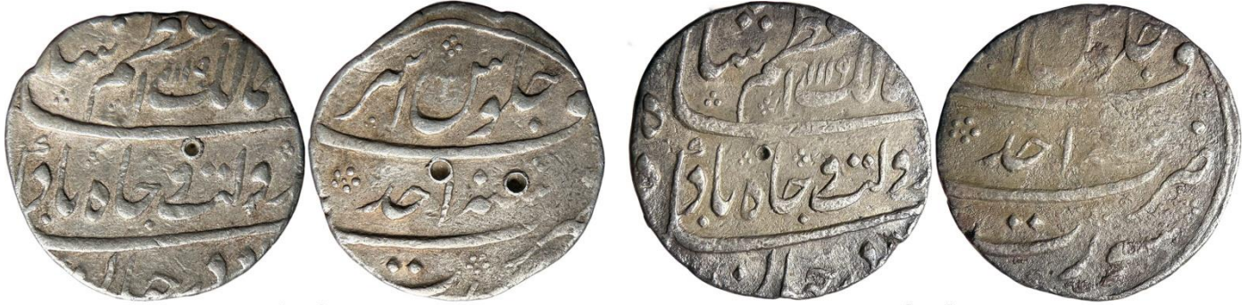
Azam Shah - Surat