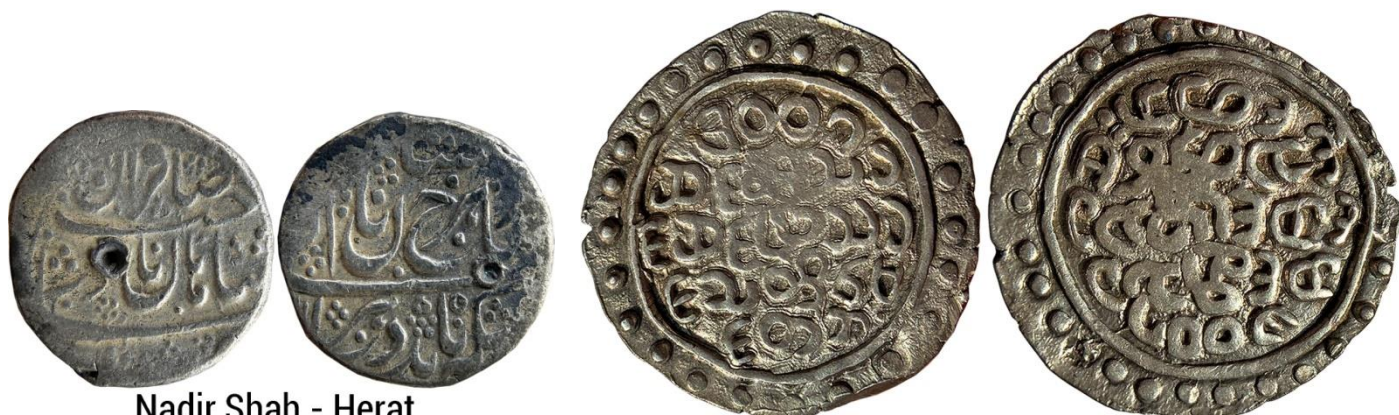
Nadir Shah - Herat