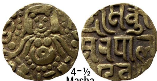
4-½ Masha Kumarapala

102. Hindu Medieval, Indo-Sassanian Series, Gurjara Pratiharas, Vigrahapala (c. 9th-10th Century AD), Billon Drama, 3.90 gms, 16.18 mm, Obverse: Stylized bust of king to right, Letter 'Shri' in front of the bust, Letter 'Vi Gra' below, Reverse: Stylized Zoroastrian fire altar flanked by stylized attendants, Letter 'Sa' replaces fire altar's shaft, KK Maheshwari # Imitations in Continuity, pg. 221, very fine, very scarce in this grade. 102. Estimated Price - ₹500 – 600