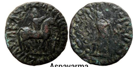
Aspavarma 17. (1.5x)

15. Ancient, Indo-Scythians, Azes (c. 1st Century BC), Copper Unit , 9.70 gms, 20.22x30.61 mm, Obverse: Elephant to right, Greek legend around partially reading 'ΒΑΣΙΛΕΩΣ ΒΑΣΙΛΕΩΝ ΜΕΓΑΛΟΥ ΑΖΟΥ', Reverse: Humped bull to right on a platform, Kharoshthi legend around partially reading 'MaharajasarajarasamahatasaAyasa', Hoover # 669, pg. 242, fine to very fine, rare.