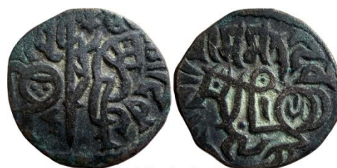
Prithviraja III 111. (2x)

110. Hindu Medieval, Chandellas of Jajekabhukti, Madana Varman (1129-1163 AD), Gold 4-1/2 Masha, 4.00 gms, 19.00 mm, Obverse: Seated Goddess Lakshmi facing, Reverse: Devanagari Legend in three lines reading 'ShrimatMa/(da)naVarmma/(Deva)', Deyell, # Living without Silver, 142, Madana Varman was a powerful ruler of the Chandella dynasty of Jejakabhukti (Bundelkhand), who restored Chandella supremacy after a period of decline. Through successful military campaigns against major neighboring powers such as the Kalachuris of Tripuri, Paramaras of Malwa, and Chalukyas of Gujarat, he expanded his kingdom to its greatest extent. His reign, recorded in inscriptions from places like Mahoba, is regarded as the last major phase of imperial strength for the Chandellas before their final decline, Graded as F 25 By PCG, rare. 110. Estimated Price - ₹45,000 – 50,000