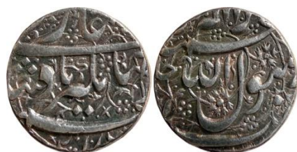
Jahangir - Jalnapur

216. Mughal, Jahangir (AH 1014-1037, 1605-1627 AD), Silver Rupee , 11.24 gms, 18.57 mm, Elichpur Mint (partially visible at bottom on obv), AH 1016, KM # 141.5, very fine, rare. 216. Estimated Price - ₹3,000 – 4,000