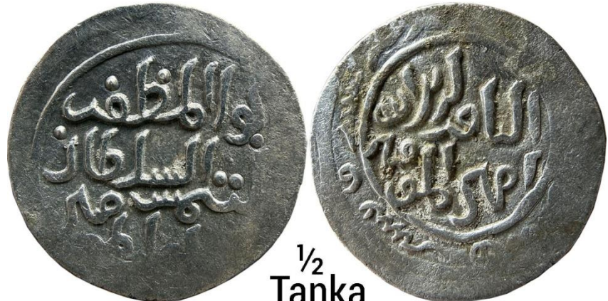
\frac{1}{2} Tanka Shams ud-din Iltutmish Unlisted in G&G