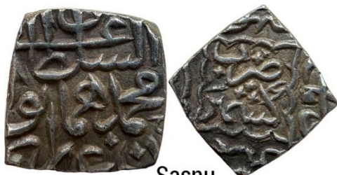
Sasnu INO Humayun Shah

159. Kashmir Sultanates, Nazuk (Nadir) Shah, 2nd Reign (AH 947-953, 1540-1546 AD), Silver Square Sasnu , 6.17 gms, 14.75 mm, Kashmir Mint (fully visible inside the square at bottom on rev), nadir in second line on obv, Obv: al-sultan al-a'zam nadir shah, Rev: mint name, Nazuk Nadir Shah was the last ruler of the Kashmir Sultanate, who reigned briefly in 1747 AD . His weak rule ended with the invasion of Ahmad Shah Durrani, which brought Kashmir under Afghan control and ended its independence, G&G # K100 , very fine, rare. 159. Estimated Price - ₹5,000 – 6,000