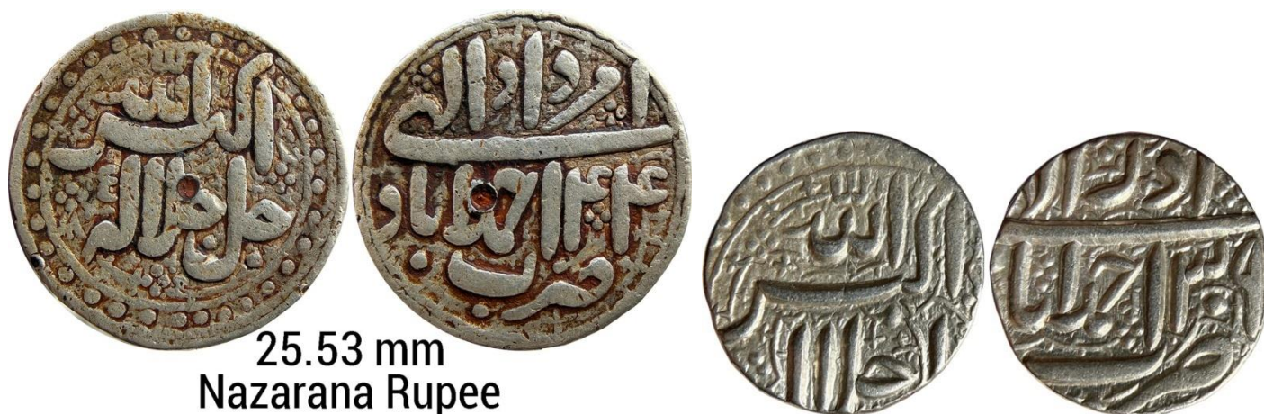
25.53 mm Nazarana Rupee