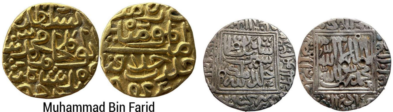
Muhammad Bin Farid

136. Delhi Sultan, Firuz Shah Tughluq (AH 752-790, 1351-1388 AD), Billon Tanka , 9.05 gms, 17.00 mm, Sahat-i-Sind Mint (mostly visible at the bottom from 5 to 7'o clock reading it clockwise on the rev), mint mark at top on rev, Obverse: al khalifa amir al mu-minin khulidat khilafatahu, Reverse: firuz shah sultani darabat bi-sahat-e-sind, G&G # D477 , very fine, extremely rare. 136. Estimated Price - ₹5,000 – 6,000