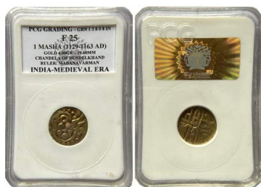
4- \frac{1}{2} Masha Madana Varman 110. (1x)

109. Hindu Medieval, Chauhans of Ajmer/Sambhar, Somalekha/Somala Devi, Queen of Ajaya Deva (1110-1125 AD), Copper Unit, 2.07 gms, 11.11 mm, Obv: Horseman riding to left, Rev: Nagari legend in two lines 'Shri So(ma) / la De(va)', exact type unlisted, very fine, very scarce. 109. Estimated Price - ₹5,000 – 6,000