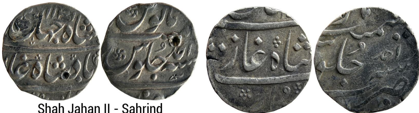
Shah Jahan II - Sahrind