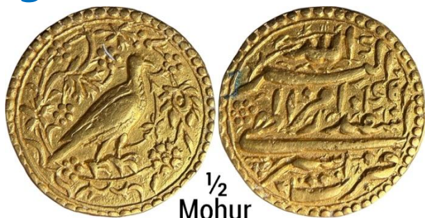
1/2 Mohur Gold Token 5.59 Gms