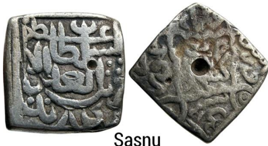
Sasnu Zain ul-Abidin