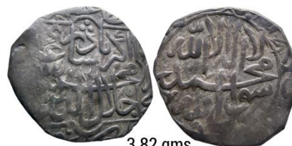
3.82 gms Akbar - Shahrukhi Ex SM Shukla Sir Collection