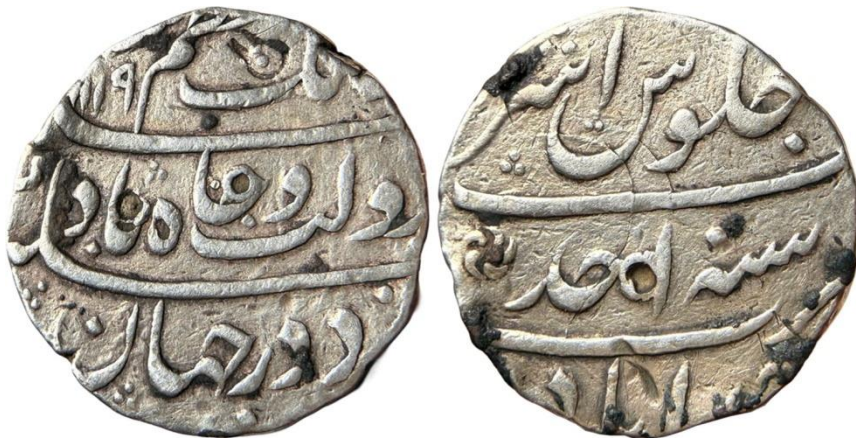
Azam Shah - Ahmadabad