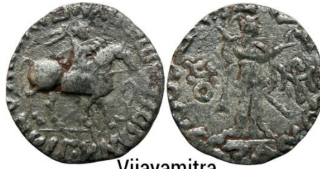
Vijayamitra 16. (1.5x)