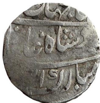
Shah Jahan II - Lakhnau