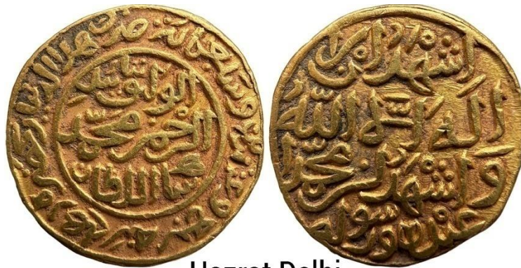
Hazrat Delhi 12.83 Gms

132. Delhi Sultan, Qutb al-Din Mubarak Shah (AH 716-720, 1316-1320 AD), Set of 2 Coins, Billon 8 Gani, 3.55 gms, 13.81 mm, 3.49 gms, 12.52 mm, NM, AH 719, Obv: in centre: qutb al-dunya wa'l din, around: abu'l muzaffar khalifat Allah, Rev: mubarak shah al-sultan ibn al-sultan, with state museum lucknow envelope also knows as Nawab Wajid Ali Shah Zoological Gardens Campus, G&G # D271, very fine, scarce. 132. Estimated Price - ₹2,000 – 2,500