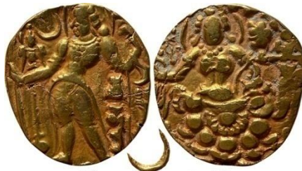
Chandragupta III 8.50 Gms