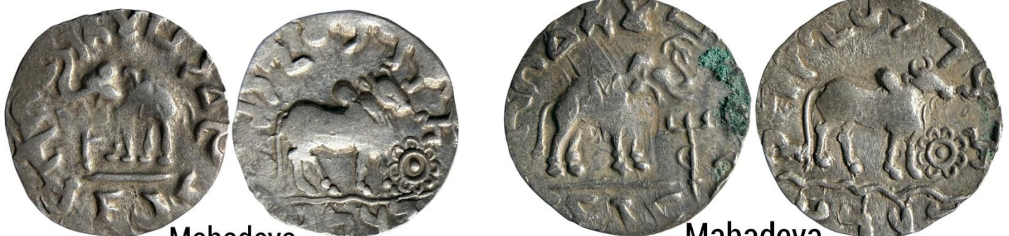
Mahadeva Elephant facing left