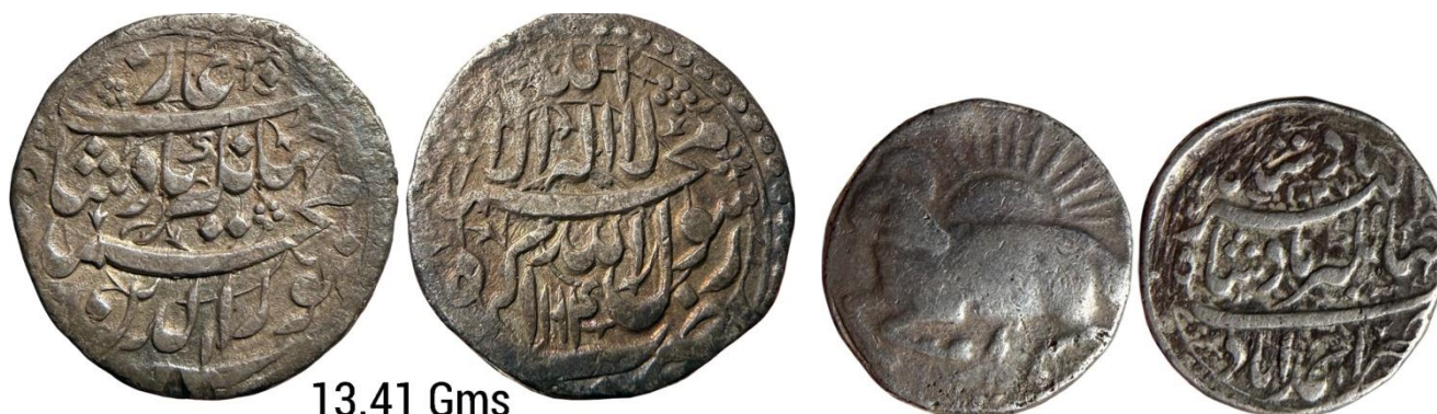
13.41 Gms 20% Heavy Silver Rupee Jahangiri Rupee

202. Mughal, Nepal Issue, Silver Mohur , 5.39 gms, 24.88 mm, imitating design of Mughal rupees Jahangir, with name of Pratapmalla of Nepal (1641-1674 AD), NS 775, 1655 AD, trishul in center on rev, During the reign of Pratap Malla, some coins from Nepal imitated Jahangir's silver rupees. They copied Jahangir's design, calligraphy, and silver standard. The primary difference was Pratap Malla's name replacing Jahangir's and the date reflecting the Nepal Samvat or local era, instead of the Hijri year . This imitation aimed to gain prestige, trust in trade, and numismatic legitimacy , reflecting Mughal influence without political subordination. These coins are rare and significant examples of cross-cultural influence in South Asian numismatics, Zeno # 219378, KM # 164 , very rare. 202. Estimated Price - ₹15,000 – 18,000