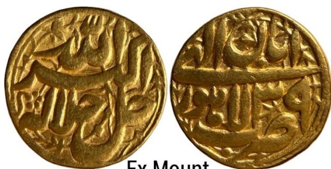
Ex Mount Akbar - Ilahi - Lahore