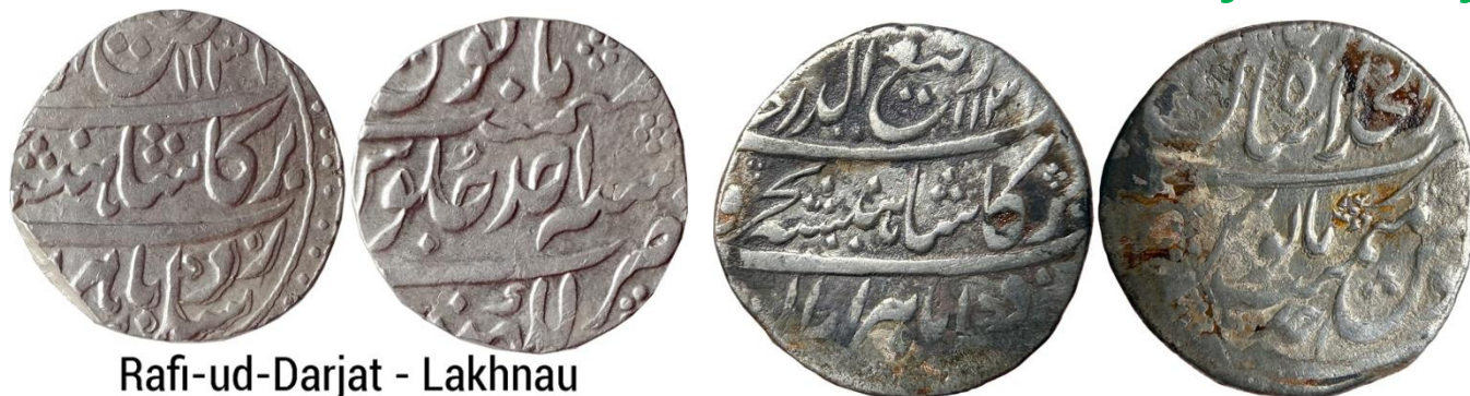
Rafi-ud-Darjat - Lakhnau