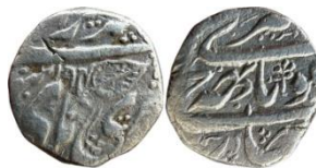
Kashmir - Gulab Singh