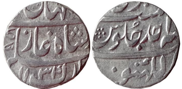
Shah Jahan II - Lakhnau