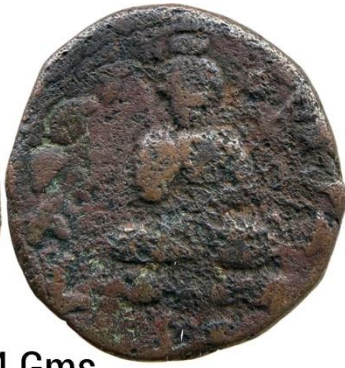
16.44 Gms Maitreya Seated Buddha Copper Tetradrachm