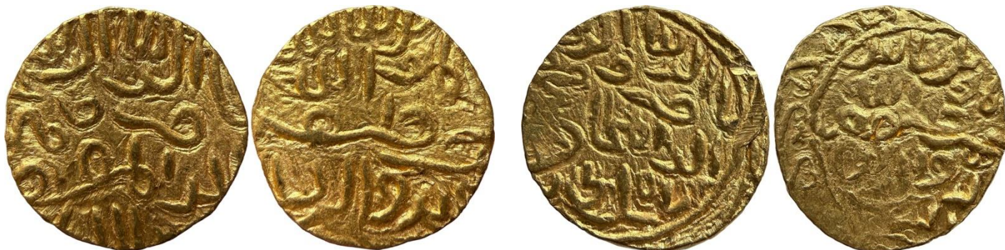
Nasir Al-Din Mahmud Shah