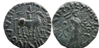
Indo-Parthian - Gondophares I