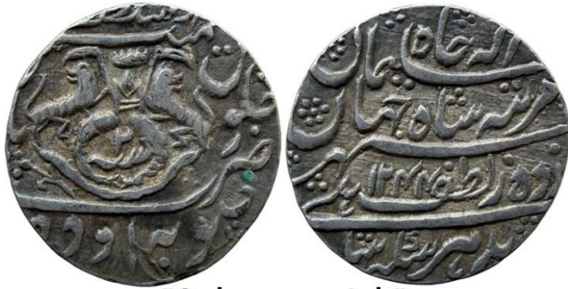
"Sulayman Jah" Nasir-ud-Din Haider's other name