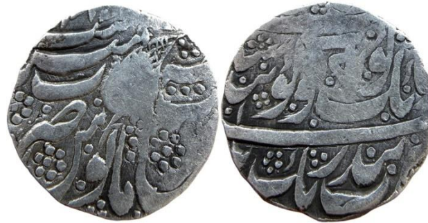
Sikh Kashmir Governor Hari Singh Nalwa VS 187(7/8)