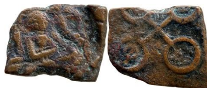
Ujjain - Abhisheka Lakshmi