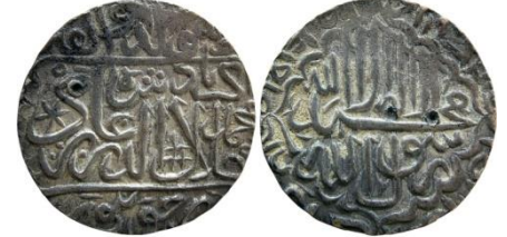
Diameter : 29.17 mm