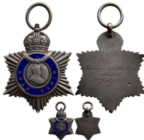
Khan Sahib - Set of 2 Full & miniature Set