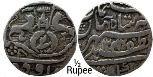
1 / 2 Rupee Nasir-ud-Din Haider - Sulayman Jah Extremely Rare