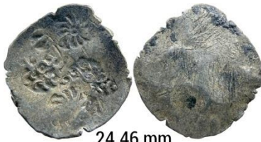
24.46 mm Kashi Mahajanapada