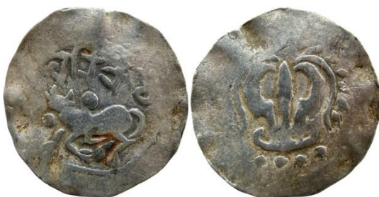
6.21 gms, 30.28 mm Chandra Ruler - Harikelas