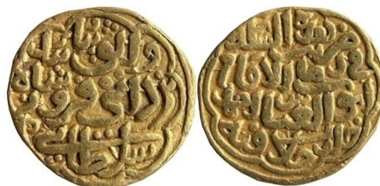
Firuz Shah Tughluq Caliph Abu'l Abbas Ahmad al-Hakim II