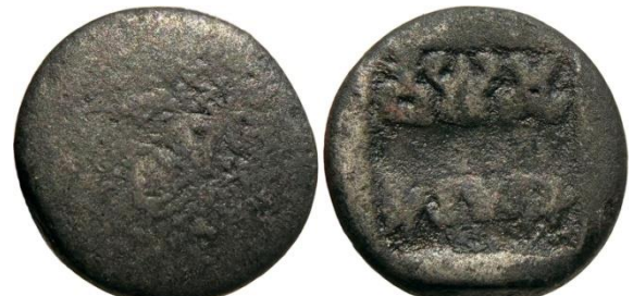
Panchala - Suryamitra 10.89 gms, 21.16 mm