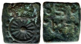
Taxila - Panchanegama

57. Ancient, Taxila Region, Guild Issue, Hirasame (c. 2nd-1st Cen BC), Copper Unit, 7.00 gms, 21.67x26.03 mm, Obv: Front facing elephant at center, Tree in railing in left field, Three arched hill (Chaitya) and Hollow cross in left field, Rev: Horse to left facing a Six arched hill, a three arched hill, Traces of Kharoshti legend 'Hirasame' in front of horse, Ref # JNSI Vol XXXV, The Local Coinage of Taxila and Gandhara, T24, extremely rare. 57. Estimated Price - ₹8,000 – 10,000