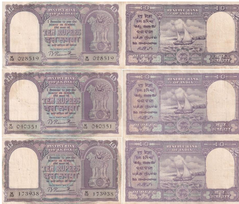
628. (Not to Scale)

628. India, Reserve Bank of India, Set of 3 Notes, 10 Rupees, B. Rama Rau, Year - 1951, Serial No. M52 028519, M52 040351, M52 173938, Watermark - Ashoka Pillar, Ref # RR & KJ # 6.4.2.1, Pic # 38, very fine, scarce.