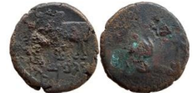
"Ayumitrasa" अयुमित्रस 'Ayumitrasa'