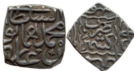
Kashmir Sultan - Haidar Dughlat INO Mughal Emperor Humayun