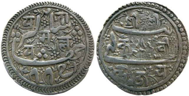
Nepal - Pratapmalla - imitating Jahangir