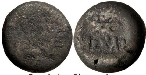
Panchala - Bhanumitra 12.83 Gms, 20.46 mm