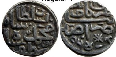
Gujarati Numerial 4