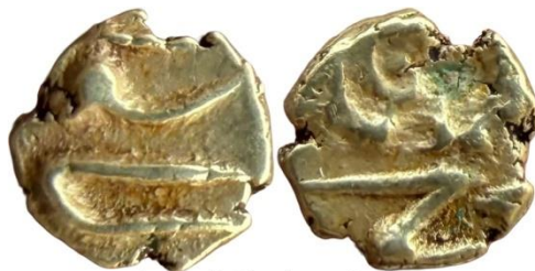
Ahmad Shah Bahadur Karpa / Kharpa / Cuddapah Mint 0.36 Gms, 5.75 mm