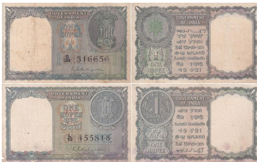
629. (Not to Scale)

629. India, Reserve Bank Of India, signed by K.G. Ambegaonkar, Set of 2 Notes, 1 Rupees Note, 1951 AD, 1). Serial # D38 316656, Ashokan Pillar in Vignette panel, Large Floral Motif on reverse, Watermark: In Window: Ashokan Pillar Capital ( National Emblem) Released in 1949, 2). Serial # L16 455818, obverse and reverse of 1 rupee coin of 1951, Watermark: in Window: Ashokan Pillar Capital, very fine, very scarce. 629. Estimated Price - ₹1,000 – 1,500