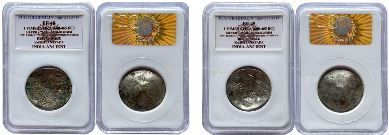
27.00x31.00 mm Kashi Mahajanapada