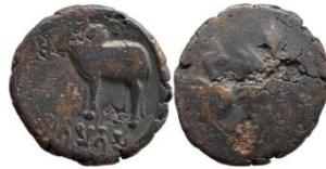
"Satyamitrasa" सत्यमित्रस 'Satyamitrasa'