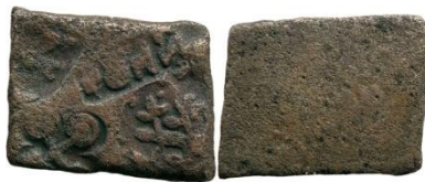
Copper PMC - Damabhadra