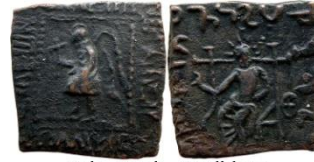
Indo-Greek - Spalirises