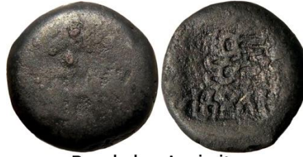
Panchala - Agnimitra 13.02 Gms, 22.15 mm