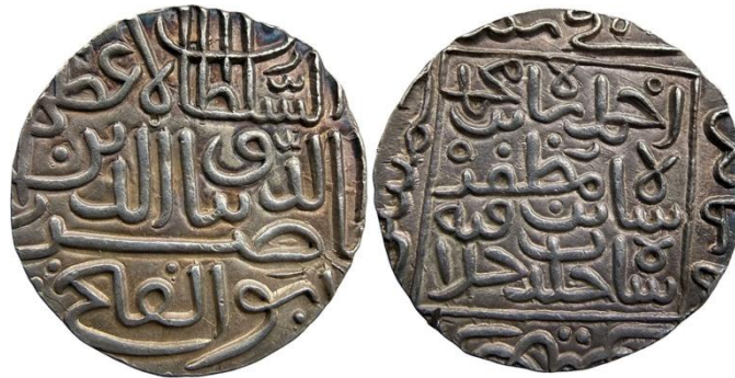
Nasir al-Din Ahmad Shah I Silver Pedigree Tanka