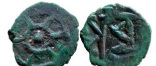
Panchala - Achyu 0.80 Gms, 12.51 mm