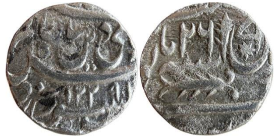
Awadh - Brijis Qadr - Suba Awadh