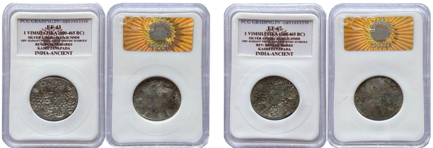
24.65x28.70 mm Kashi Mahajanapada

01. Ancient, Archaic Punch Marked Coinage, Attributed to Gandhara Janapada, Silver 2 Shana or 1/4 Shatamana, 2.90 gms, 14.37x15.39 mm, “Local Swat Valley” type, Single 5 armed symbol on obverse, a Very Rare denomination as compared to the larger Bent Bar, Five armed symbol instead of the usual six armed symbol. This type too is found only in the Swat valley. It is argued that the denomination and weights of this type are somewhat different and perhaps could be attributed to Kamboja Janapada?, punch with 5 arms instead of the regular issue of Gandhara, which always has 6 arms (Rajgor-561 to 567), said to be from a small hoard discovered about 12 years ago, An alternative attribution is that this is not Kamboja Janapada, and is instead a rare variety of Gandhara with a 5-armed symbol instead of 6-armed (Rajgor-561 to 567), The ancient Kingdom of Gandhara was one of the original sixteen Mahajanapadas (“Great Kingdoms”) mentioned in ancient Buddhist texts like the Anguttara Nikaya. Gandhara, centered around the important ancient cities of Purushapura (modern Peshawar). Takshashila or Taxila, and Pushkalavati (the capital of the Kingdom) and covering the regions of northern Pakistan and eastern Afghanistan, though on occasions it extended as far as Kashmir, See Fishman, JONS 202, Fig. 5, Uniface, Unlisted, very fine, very rare. 01. Estimated Price - ₹1,000 – 1,200