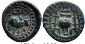
4.71 Gms, 16.55 mm