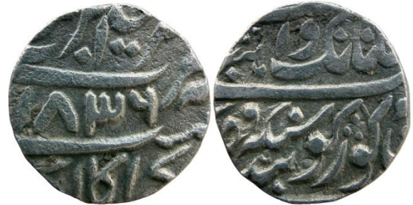
Sikh - Misls VS 1836 Amritsar Mint