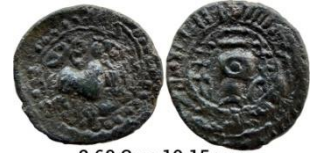
3.62 Gms, 19.15 mm