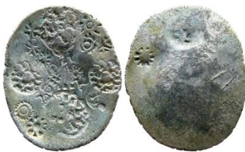
24.55x29.60 mm Kashi Mahajanapada PMC