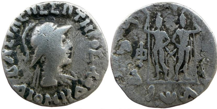
Indo-Greek - Diomedes Extremely rare