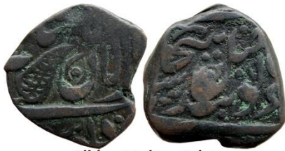
Sikh - Multan Mint Nanakshahi Couplet Copper Paisa