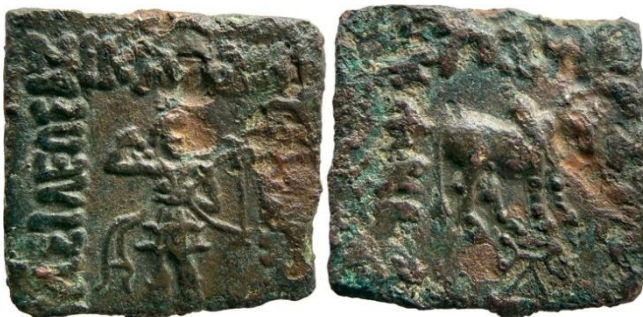
Indo-Greek - Artemidoros