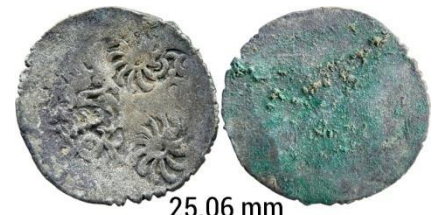
25.06 mm Kashi Mahajanapada PMC