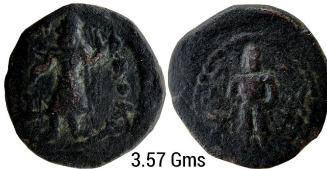
3.57 Gms Sakyamuni Standing Buddha Copper Drachm 1/4 Unit