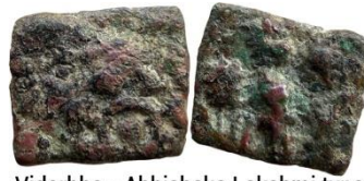
Vidarbha - Abhisheka Lakshmi type