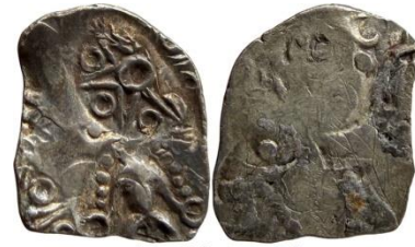
Vidarbha Region 1/4 Karshapana