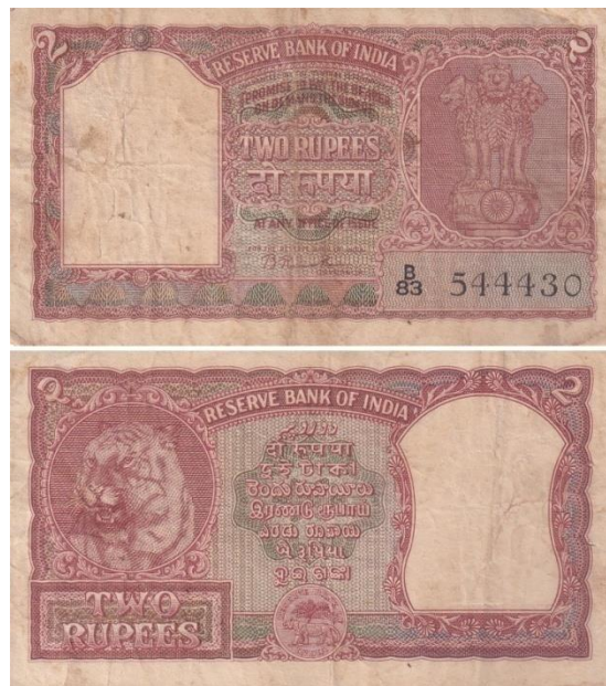
630. (Not to Scale)

630. Reserve Bank of India, 2 Rupees, signed by B. Rama Rao, Serial No.: B83 544430, Hindi numeral 2 in top right corner, J&R # 6.2.1.1, fine to very fine, very scarce.