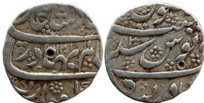
Shah Alam Bahadur - Bahadurgarh