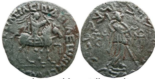
Indo-Scythian - Vijayamitra