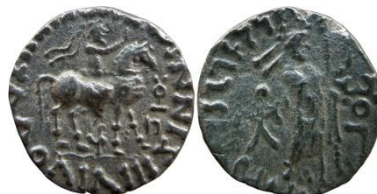
Indo-Parthian - Gondophares I