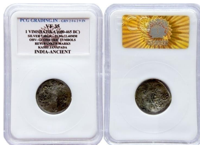
21.00x22.40 mm Kashi Mahajanapada