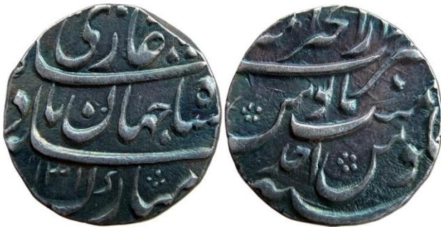
Shah Jahan II Rafi ud-Daula Dar ul-Khair Ajmer