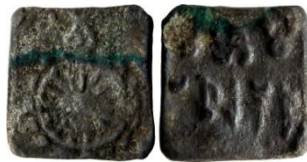
Taxila - Panchanegama