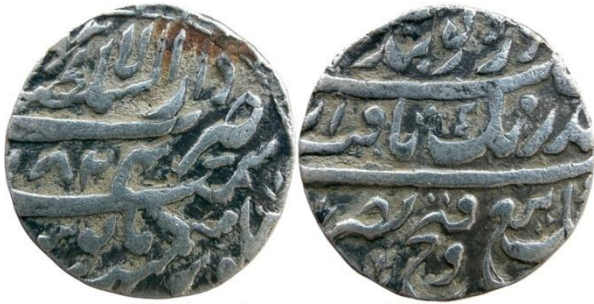
Sikh - Misls VS 1824 Lahore Mint