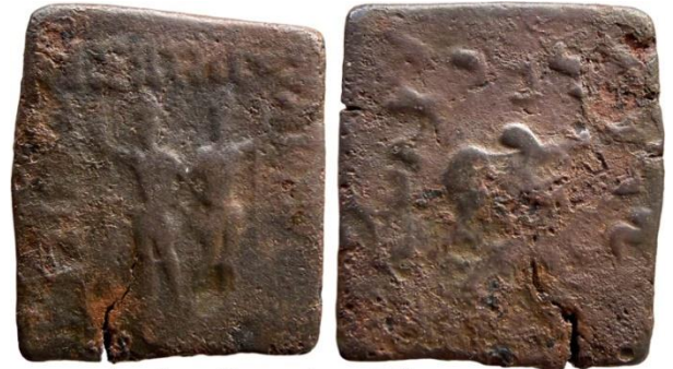
Indo-Greek - Diomedes