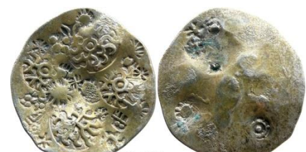
28.06 mm Kashi Mahajanapada