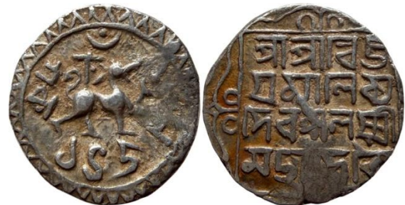
Tripura - Vijaya Manikya