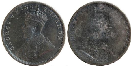
Error Brockage Lakhi