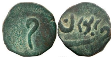
Rewa - 2 Paisa

521. Indian Princely States, Ratlam State, Anonymous Issue, INO Shah Alam II (AH 1174-1221, 1759-1806 AD), Set of 2 Coins, Copper Kachcha Paisa, 13.45 gms, 20.13 mm, 13.84 gms, 19.38 mm, Raj Series, 'Raej' in dotted circle on obverse, very fine, scarce. 521. Estimated Price - ₹1,200 – 1,500