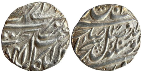
VS (1)841 - Guru Nanak Era 31(5/6)