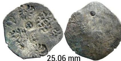
25.06 mm Kashi Mahajanapada