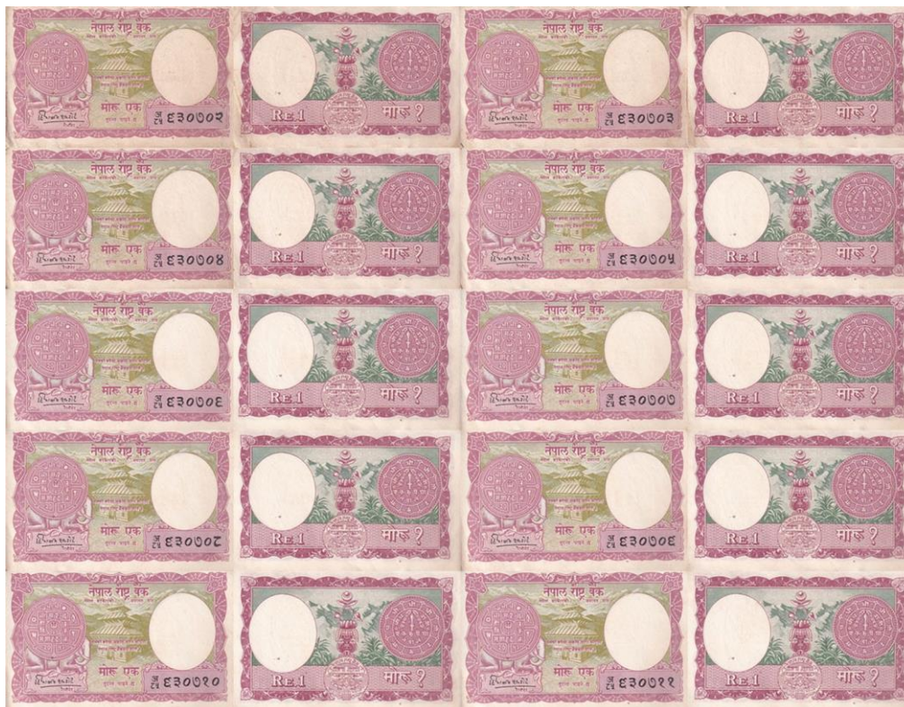
632. (Not to Scale)

632. Nepal, Mahendra Bir Bikram (1955-1972 AD), Signed by Himlaya Shumsher, Set of 10 Notes, 1 Mohru, 2013 AD, Prefix: ॐ 85, Serial # 930702-930711, Obverse of a coin and Elephant (L.), Temple (C.), Watermark Window - Crown on Watermark (R.), Reverse Watermark Window (L.), Kalash - a holy vase (C.), Reverse of coin (R.), P # 8, Numista # 203437, very fine, scarce. 632. Estimated Price - ₹3,000 – 4,000