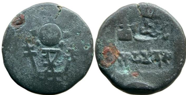
Panchala - Suryamitra 14.06 gms, 24.37 mm

82. Ancient, Ayodhya Region, Ayumitra (1st Century BC), Copper Unit, 8.02 gms, 18.87 mm, Obverse: A bull to left facing a standard, Brahmi legend below reading 'Ayumitrasa', Reverse: A rooster facing a Palm tree, Pieper # 1064, pg. 161, fine, rare. 82. Estimated Price - ₹1,500 – 2,000