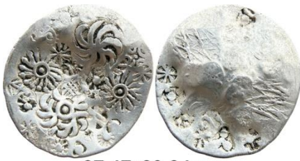
27.47x29.84 mm Kashi Mahajanapada