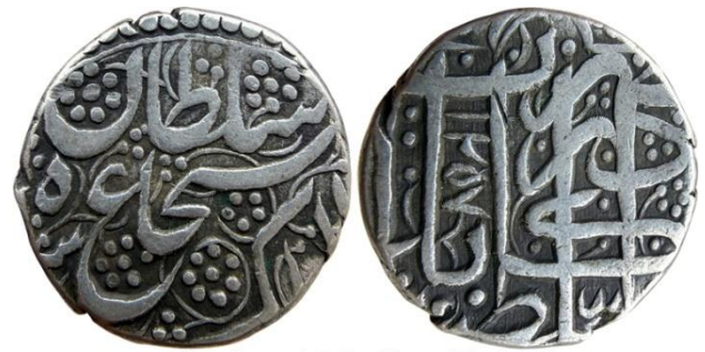
Shuja al Mulk - Kabul