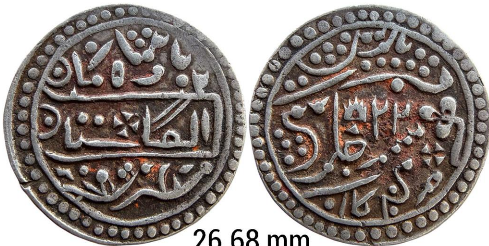
26.68 mm Nazarana Rupee