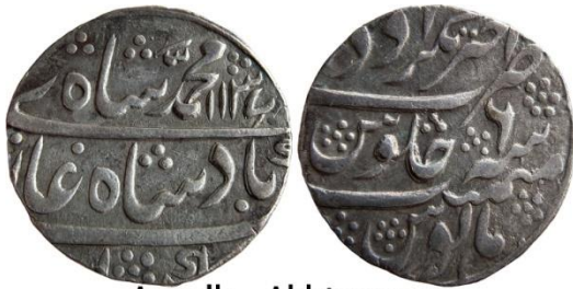
Awadh - Akhtarnagar