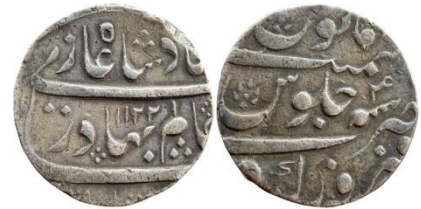
Shah Alam Bahadur - Firozgarh