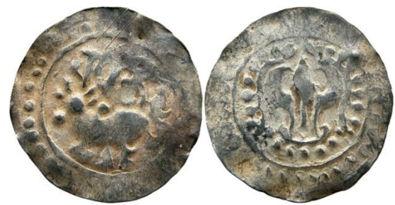
5.97 gms, 31.44 mm Chandra Ruler - Harikelas