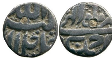
Akbar - Ahmadnagar