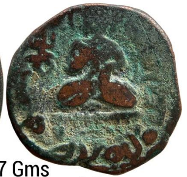
14.27 Gms Maitreya Seated Buddha Copper Tetradrachm