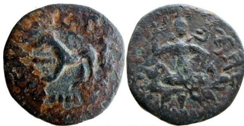
Nepal - Lichhavi

144. Ancient, Kashmir, Mihirakula (515-540 AD), Copper Dinar, 7.54 gms, 22.56 mm, Obv: King standing in Kushan style, holding Scepter in his left hand, his right hand sacrificing at fire altar, Late Brahmi legend in left field reading 'Shahi Mihi' and in right field reading 'ragula', Rev: Goddess of plenty Ardoksho (Lakshmi) seated facing on a throne, holding cornucopia and diadem, MAC # 3779, very fine, very rare in this grade. 144. Estimated Price - ₹15,000 – 18,000