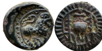
8.09 Gms, 18.46 mm