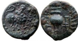
3.40 Gms, 16.69 mm