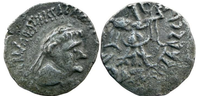
Indo-Greek - Strato II