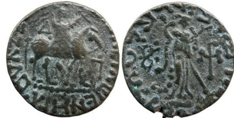
Indo-Scythian - Vijayamitra