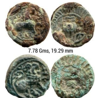
7.78 Gms, 19.29 mm