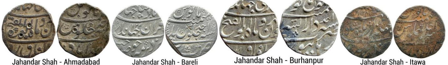
Jahandar Shah - Ahmadabad