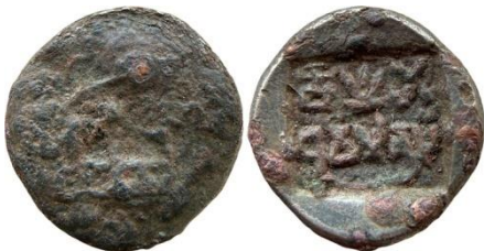
Panchala - Dhruvamitra 4.53 Gms, 18.10 mm

87. Ancient, Panchala, Bhadrachosha (c. 1st Century BC), Copper Heavy Unit, 17.74 gms, 27.03 mm, Obverse: Standing deity (Goddess Bharda?) on a lotus, Shrivatsa at left, Reverse: Three Panchala symbols on top, Brahmi legend 'Bhadrachosasa' below, Pieper # 1362, pg. 209, fine to very fine, very rare. 87. Estimated Price - ₹8,000 – 10,000