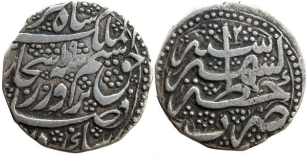
Shuja al Mulk - Kashmir