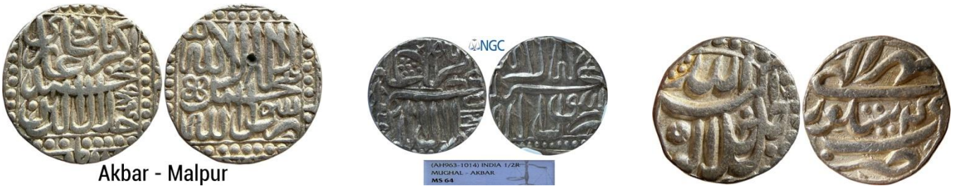
Akbar - Malpur

264. Mughal, Akbar (AH 963-1014, 1556-1605 AD), Copper 1/2 Dam , 10.14 gms, 17.29 mm, Lahore Mint (fully visible at top on rev), Ilahi type Month Bahman (Aquarius) , RY 36, Obv: Ilahi 36 month Bahman, Rev: Falus-i-Lahore, KM # 23.5, very fine, very scarce. 264. Estimated Price - ₹2,500 – 3,000