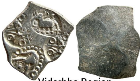
Vidarbha Region 1/2 Karshapana