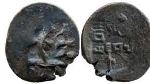
Panchala - Yajnabala 1.89 Gms, 16.55 mm