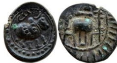
3.82 Gms, 14.52 mm