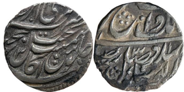
VS (1)843 - Guru Nanak Era 31(7/8)