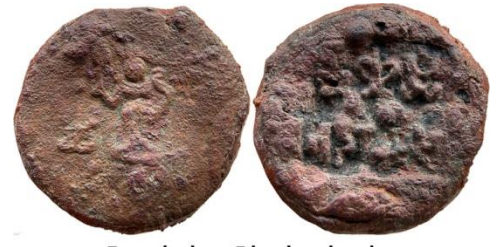
Panchala - Bhadrachosha Weight : 17.74 Gms