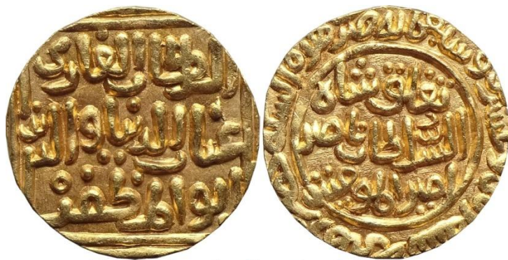
Ghiyath Al-din Tughluq Hadrat Delhi Mint