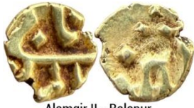
Alamgir II - Balapur 0.36 Gms, 5.94 mm