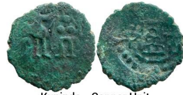
Kuninda - Copper Unit