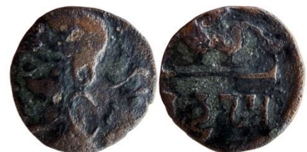
Gupta - Chandragupta II - Copper Unit