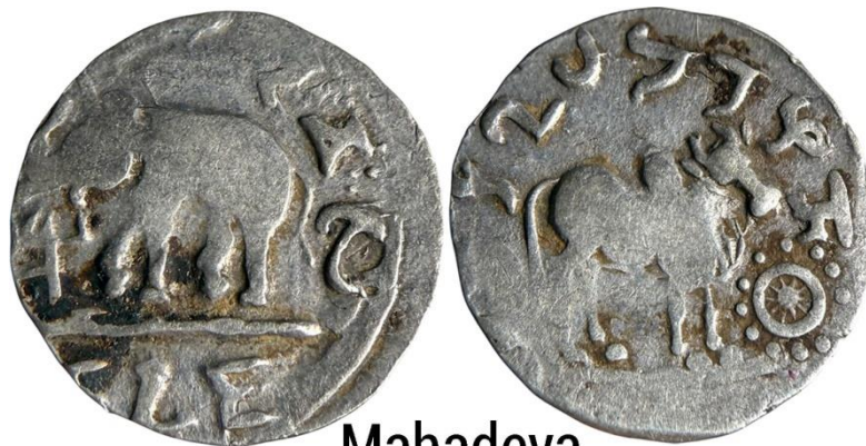
Mahadeva Elephant facing left