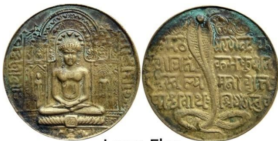
Large Flan 63.44 Gms, 57.96 mm