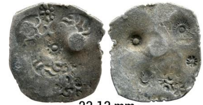
23.13 mm Kashi Mahajanapada