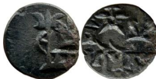
Panchala - Agnimitra II 2.40 Gms, 14.81 mm