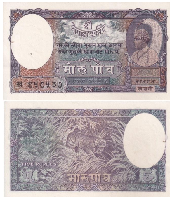
631. (Not to Scale)

631. Nepal, Tribhuvan Bir Bikram Shah (1951-1955), Signed by Bharat Raj Pandit (BRP), 5 Mohru (5 NPR), Prefix: ख, Serial # 657537, Obverse Watermark Window - Portrait of King Tribhuvan in Watermark (L.), Himalayan Range (C.), Portrait of King Tribhuvan in Plumed Crown (R.), Reverse Tiger in Jungle, Watermark Window, P # 2, Numista # 204107, Almost UNC, very scarce.