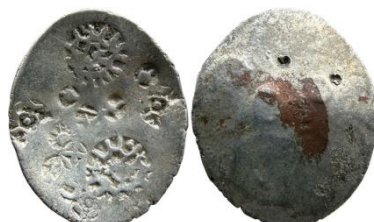
25.64x30.41 mm Kashi Mahajanapada