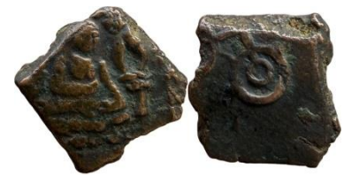
Ujjain - Abhisheka Lakshmi