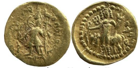
Kushan - Vasudeva II Gold 1/4 (Quarter) Dinar