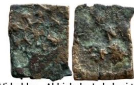
Vidarbha - Abhisheka Lakshmi type