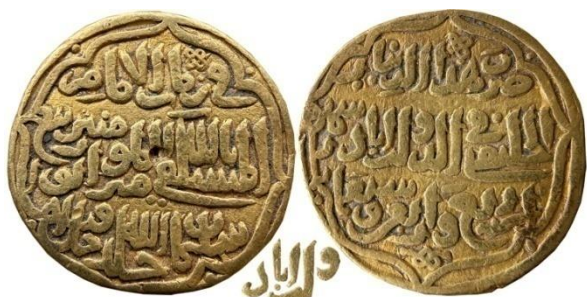
Muhammad Bin Tughluq - Daulatabad