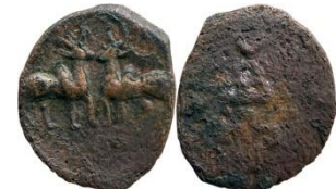
Taxila Region Bulls Facing Each Other