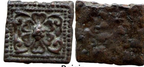
Rajgir 118. (2x)

117. Ancient, Western Kshatrapas, Kardamaka Family, Gujarat, Rudrasimha I Son of Rudradaman I (177-198 AD), Silver Dramma, 1.90 gms, 14.07 mm, Obverse: Capped bust of king to right, SE date behind head reading 1xx, Reverse: Three arched hill (Chaitya) flanked by Sun and Moon, Brahmi legend around clockwise from 2 O clock reading as 'RajnoMahakshtrapasaRudradamaputrasaRajnoMahakshtrapasa Rudrasihasa', Fishman # 11.6, about very fine, full legend visible, very scarce.