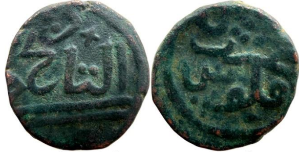
Malwa Sultan - Baz Bahadur