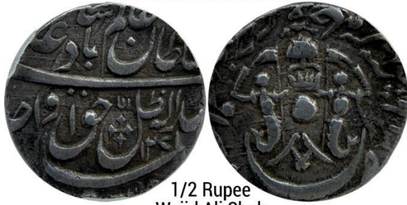
1/2 Rupee Wajid Ali Shah Very rare

AWADH STATE WAJID ALI SHAH (1847-56) ½ RUPEE | AH 1271 LUCKNOW MINT XF 45