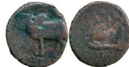
"Ayumitrasa" अयुमित्रस 'Ayumitrasa'