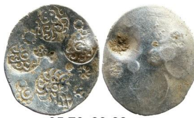
25.70x29.66 mm Kashi Mahajanapada