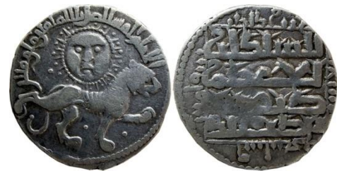
Seljuqs of Rum Ghiyath al-Din Kay Khusraw II