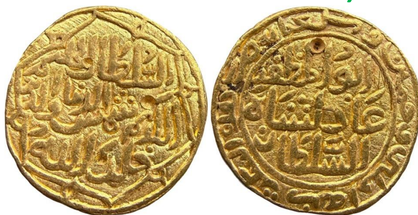
Shams al Din Adil Shah Exceedingly rare