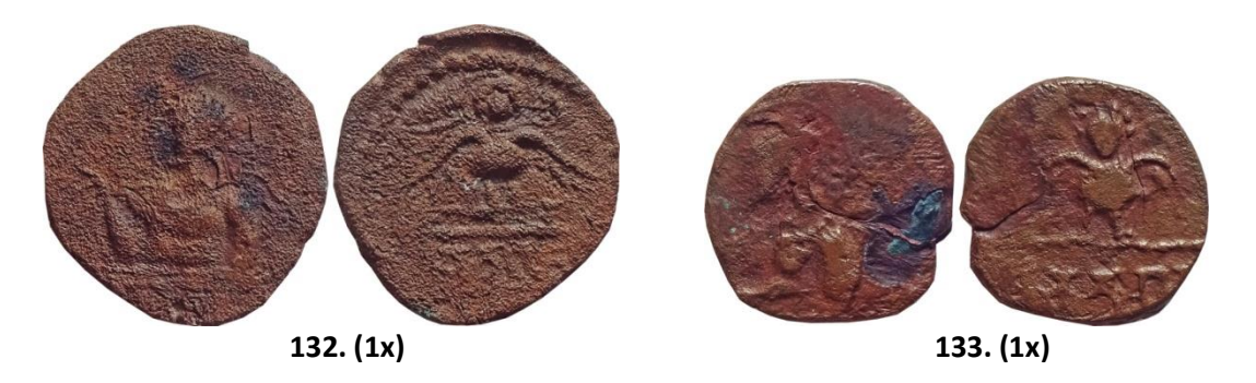
132. Ancient, Gupta Empire, Chandragupta II (c. 376-413 AD), Copper Unit , 3.10 gms, 17.30 x 18.43 mm, Obv: Standing king type with hands resting on a balcony railing, Rev: Front facing Garuda with Brahmi legend below reading "ChaNdra(GuPta)", Ref: Shivlee, Standing King Type, Variety A, pg 280 , fine, extremely rare.