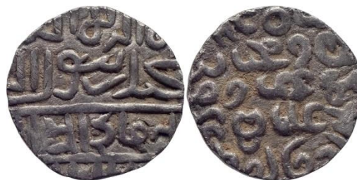
Trilingual Silver Tanka

178. Kashmir Sultan, Zain al-'Abidin (AH 823-874, 1420-1470 AD), Gold Dinar , 11.04 gms, 21.47 mm, Dar al-Saltanat Kashmir Mint, AH 851 , Obv: Arabic legend Na'ib Amir al-Mumineen Qutb al-Dunya wa al-Din Abu al-Mujahid al-'Adil Zain al-'Abidin al-Sultan. Rev: Shahada in circle, date and mint details in the margin, G&G # K5 , extremely fine, extremely rare. 178. Estimated Price - ₹1,10,000 – 1,20,000