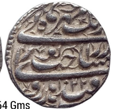
13.64 Gms 20% Heavy Silver Rupee Jahangiri Rupee