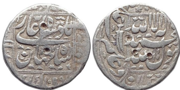
2 Bladed Sword Zulfiqar