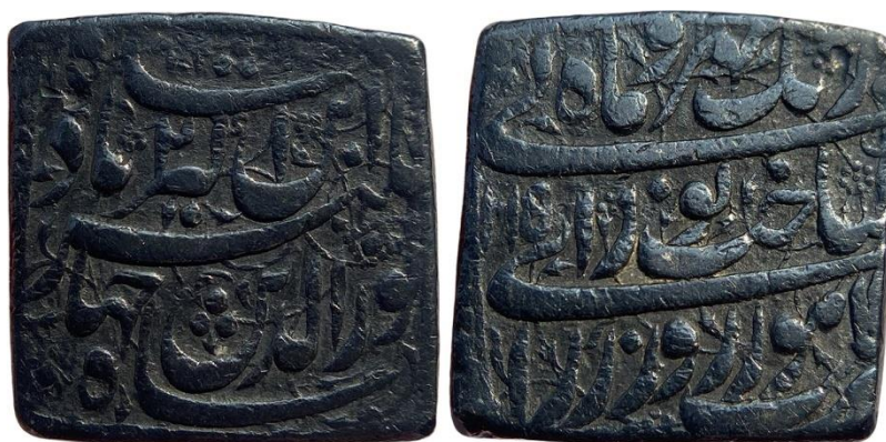
13.60 Gms Square Heavy Rupee (20% Heavy Weight)