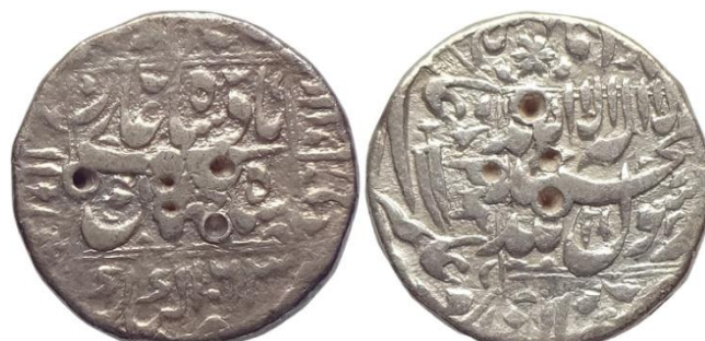
2 Bladed Sword Zulfiqar