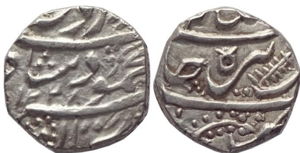
Sikh Empire, Derajat Mint