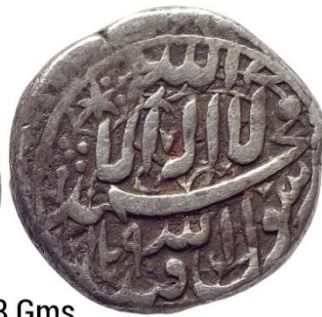
13.58 Gms 20% Heavy Silver Rupee Jahangiri Rupee