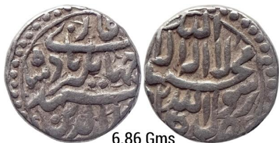
6.86 Gms Sultani (Heavy ½ Rupee)