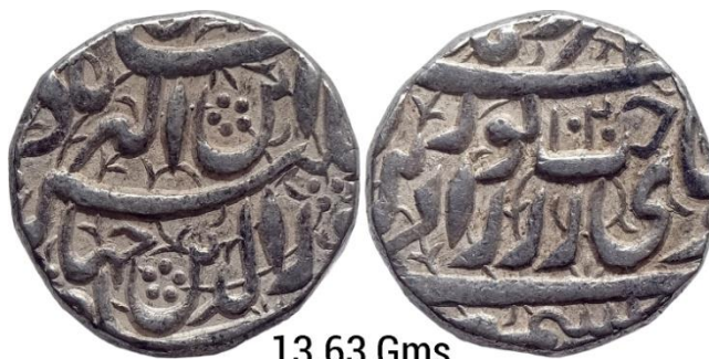
13.63 Gms 20% Heavy Jahangiri Rupee