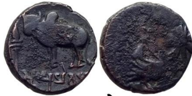
"Ayumitrassa" अयुमित्र 'Ayumitra'

169. Ancient, Tribal Republic, Sibi Janapada (c. 2nd-1st Century BC), Copper Unit, 3.35 gms, 17.55 mm, Obverse: Traces of Swastika and Tree at center, Brahmi legend around '(Majhami)kaya Shibi(janapadasa)', Reverse: Six arch hill with river below, Pieper # 1410, pg. 217, fine to very fine, very rare. 169. Estimated Price - ₹5,000 – 6,000