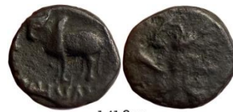
1.41 Gms Fractional Unit "Ayumitrassa" अयुमित्र 'Ayumitra'