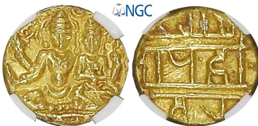
(1377-1404) INDIA 1/2PAG VIJAYANAGAR MS 65