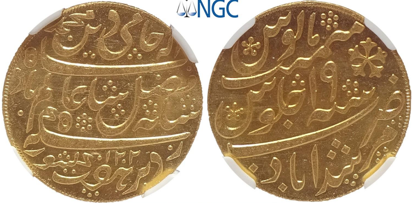
AH1202//19 INDIA MOHUR BENGAL PRESIDENCY OBLIQUE MILLING MS 64