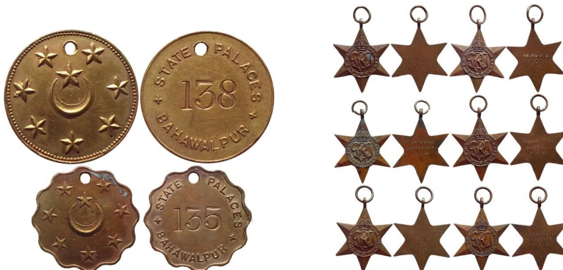
835. (1 x)

834. Agricultural and Horticultural Society of India, Copper Medal, 19.73 gms, 43.71 mm, obv. Hindu ryot ploughing the field with two bullocks, with temples, palm trees and mountains in the background, and fruit produce in the foreground, similar to Zeno # 269808, Pudd # 824.1.3, extra fine, scarce. 834. Estimated Price - ₹3,000 – 3,500